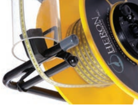
Figure 3 Hanger to support the meter at the well head. Tape Guide to protect the tape from sharp edges.

Item WLM Electronic Panel Thumb Screws (Set of 2)