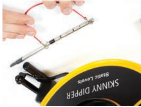
Figure 2 To Test the Entire System: Make sure sensitivity dial is turned fully clockwise. Touch one end of a conductive wire to the probe body and the other end to the last weight. This will create a short in the probe, the buzzer will sound if the system is okay.