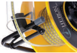
Figure 3 Hanger to support the meter at the well head. Tape Guide to protect the tape from sharp edges.