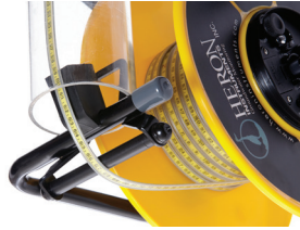
Figure 3 Hanger to support the meter at the well head. Tape Guide to protect the tape from sharp edges.